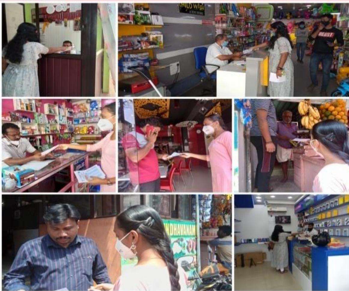
Distributing pamphlets of women helpline numbers