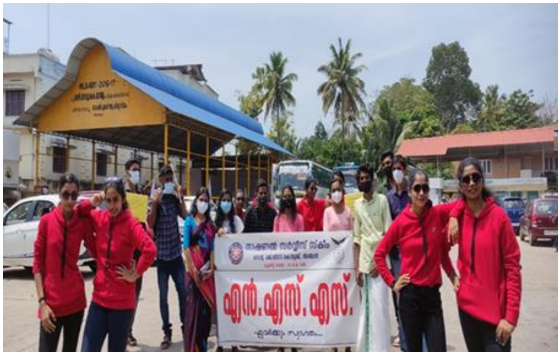
Pamphlet Distribution of Women Helpline Numbers