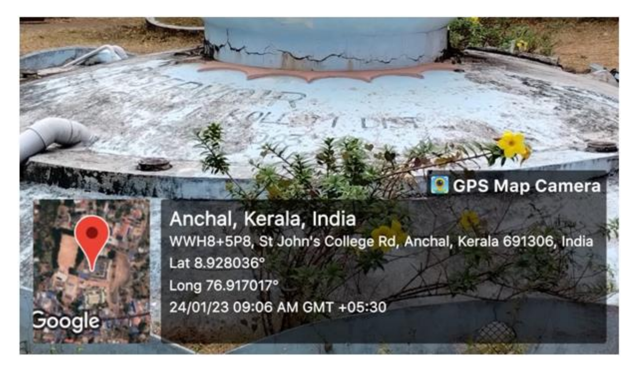
Water harvesting tank with capacity 1.5 lakh litres