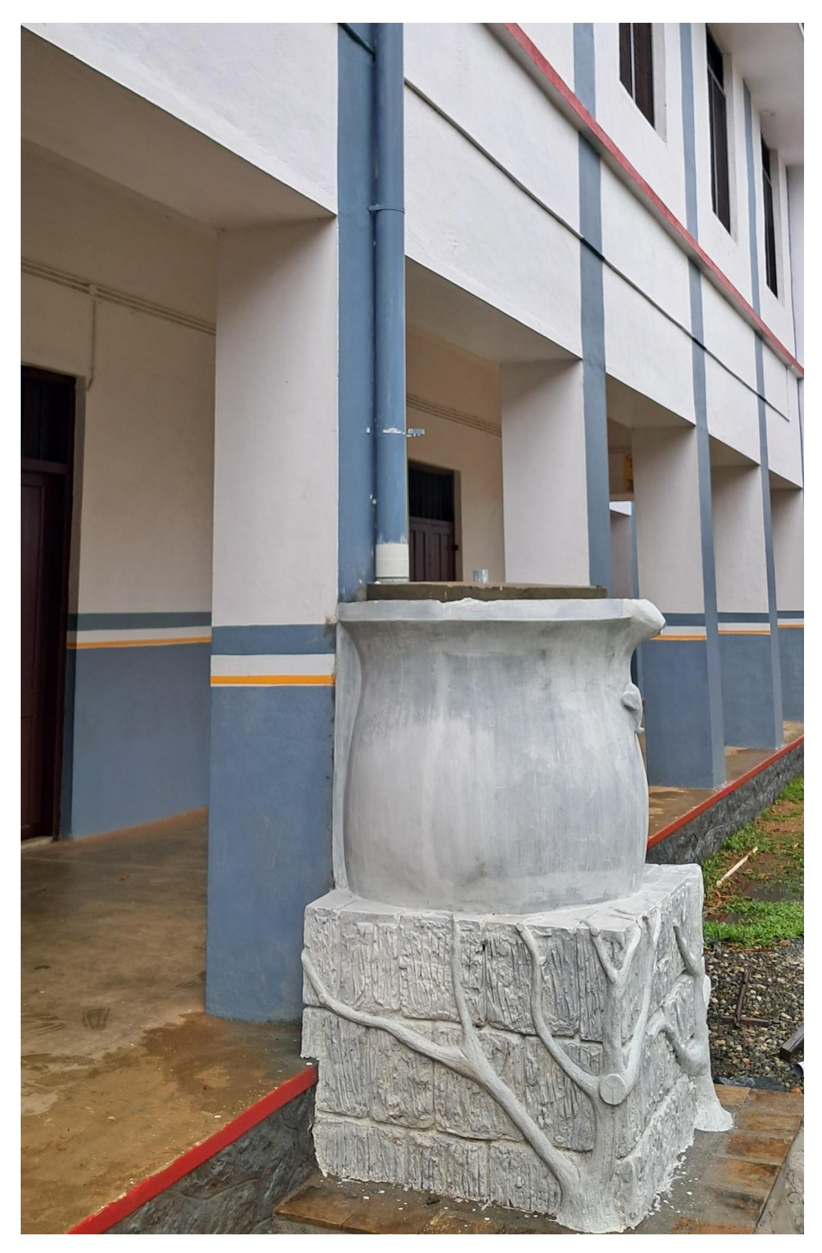
Unified water collecting pits for water harvesting from roof tops