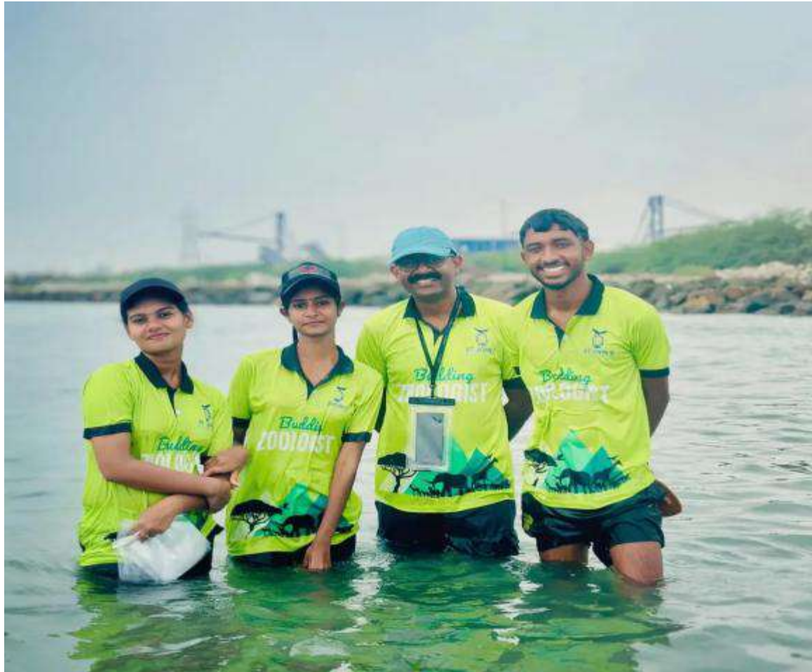
Department of Zoology for Aquatic Sample Collection at Toothukudy, Tamil Nadu