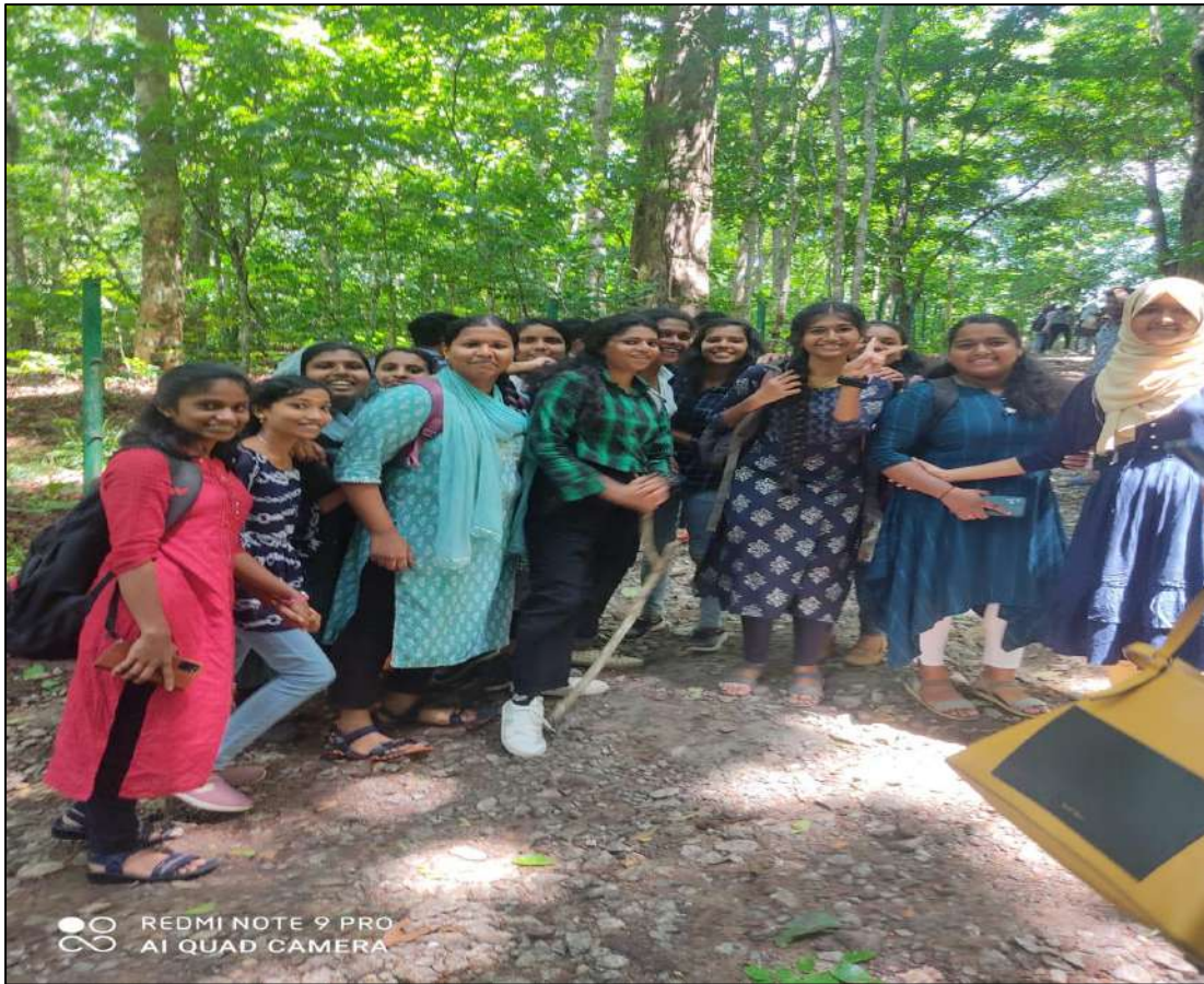
At Kuddukathupara as part of CG1371