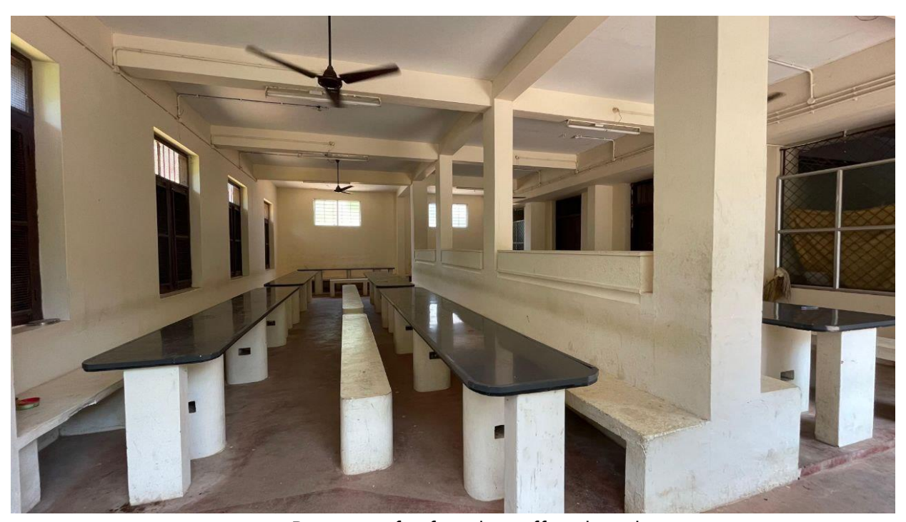
Restroom for female staff and students