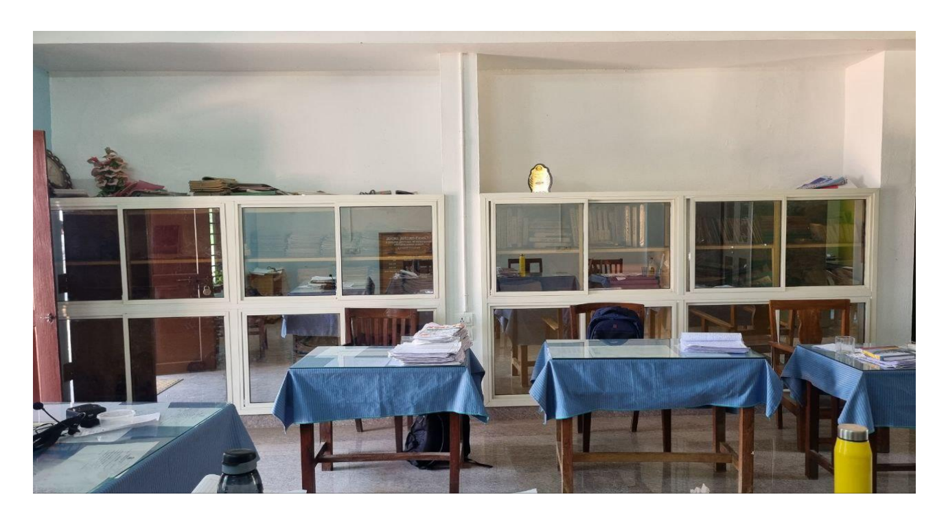
Adequate furniture for teaching and non teaching staff