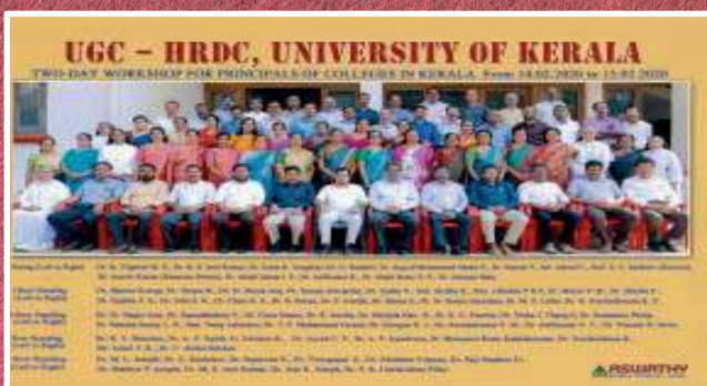
Two-day workshop for principals of Colleges in Kerala