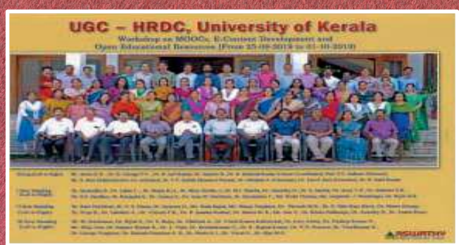
Workshop on MOOCs, E-content Development and Open Educational Resources