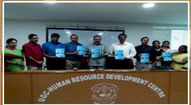
SIRA BOOK release organized by the Alumni Association of RC in Education